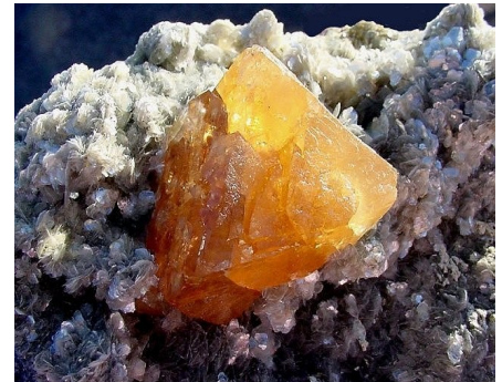
Scheelite crystal on Muscovite Mt. Xuebaoding, Sichuan, China

< www.6.cityu.edu.hk/Chinese-minerals/ >