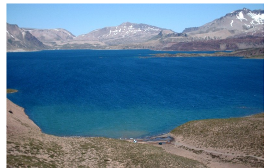
Laguna Maule Photo

< http://news.wisc.edu/uw-team-explores-large-restless-volcanic-field-in-chile/ >